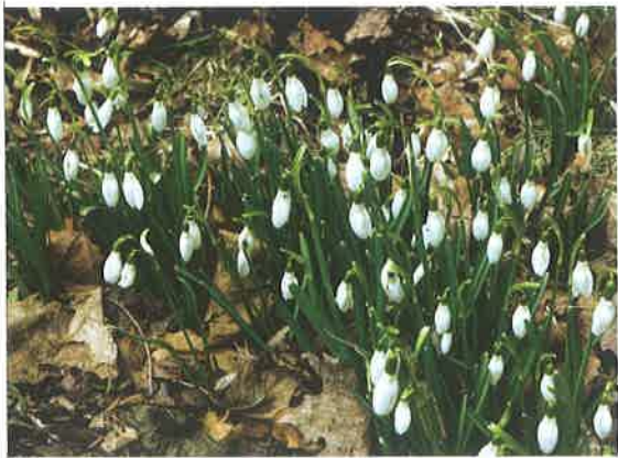
Snowdrops emerging in late February.

At first glance, the garden grows on you